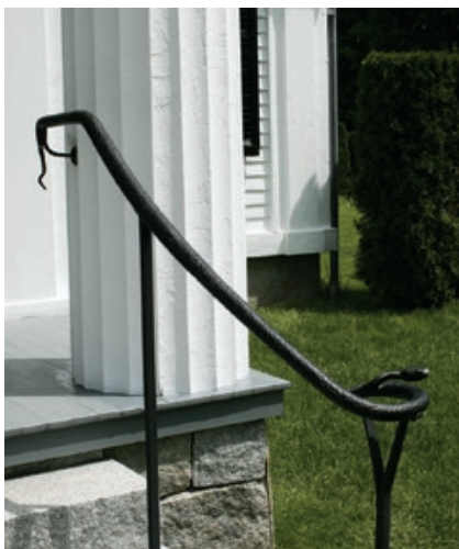
Figure 4. As a final touch, the clients — who named the house “Copperheads” as a joke because of their red hair — commissioned custom handrails in the shape of snakes. They were made and installed by Horst Around the House in LaGrangeville, N.Y.

materials, we didn’t want to waste too much. After setting up the molder and testing it with a pine mock-up ( Figure 2, page 22 ), I ran all of the stock through.