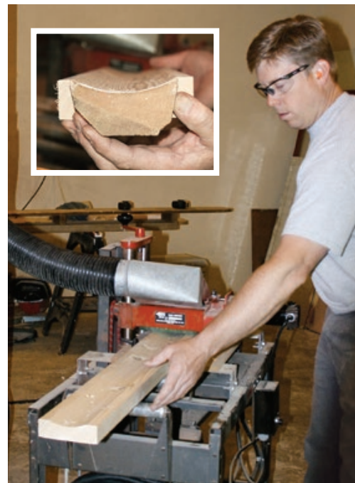
Figure 2. Spanish cedar boards were milled into fluted staves using a William and Hussey VFO6 molder. The custom-ordered knives, also from William and Hussey, cost around $150. It took one man one day to mill all the stock, making two passes per piece to avoid chattering while hogging out the 1/2-inch-deep cut for the fluted profile (inset).

roof. This meant that before removing the column bottoms and existing porch, we only needed to install diagonal bracing to keep the portico from sagging (see top left photo, previous page). And because the four columns were not load-bearing, we just had to keep them from moving. We supported each pair with a 2x12 chained to a come-along that in turn was fastened to a metal strap fed through a hole drilled through the pediment.