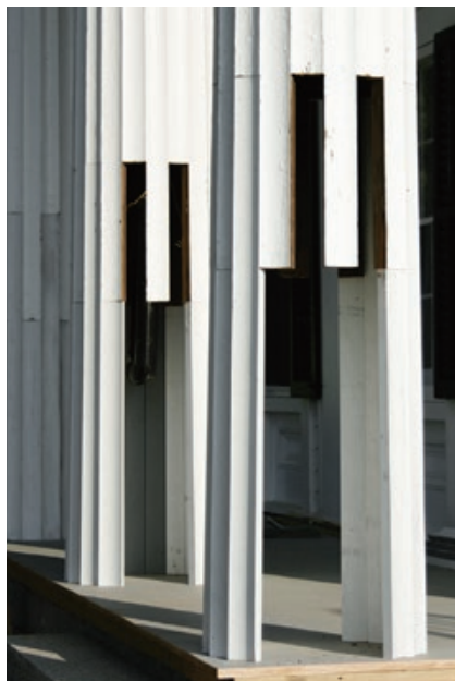
Figure 3. Starting with a long piece, five to seven custom-cut staves were installed on either side of a temporary 2x12 support, which was then removed so the final staves could be installed. Each segment joint was edge-glued with Titebond II and clamped with stainless steel screws driven at an angle every 15 to 20 inches.